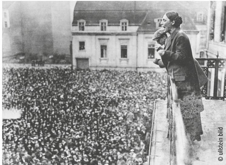
The Founding Chairperson Marie Juchacz

Shortly after the introduction of women's suffrage, Marie Juchacz was the first member of parliament to speak at the freely elected Weimar National Assembly. As a working child, seamstress and convinced social democrat, Marie Juchacz no longer wanted to accept the impoverishment of the people after the First World War.